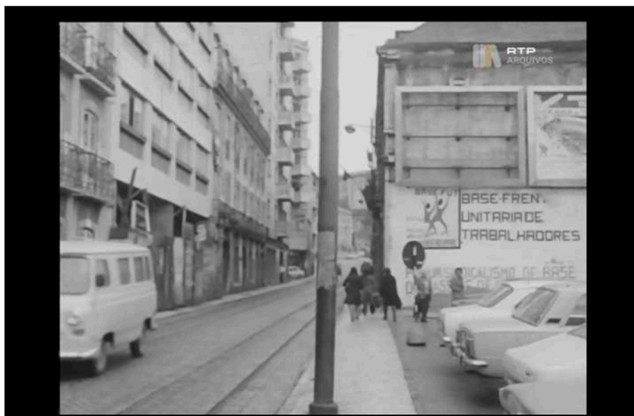
São Bento Street, where the Domestic Workers' Union headquarters was located. Still from the programme Servir em casa alheia ( Serving in other people's homes ), Cinequipa (27 December 1975).